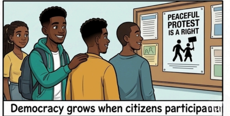
Democracy grows when citizens participate